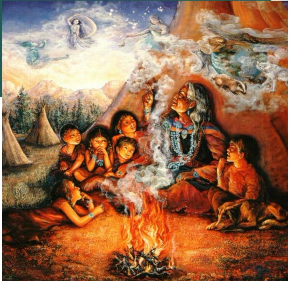
Hopi art by Josephine Wall

A qualitative study was conducted to learn how Elders can utilize talking circles to inform youth of the deleterious effects of alcohol use and abuse (Momper et al., 2017). Specifically, the researchers recruited Tribal elders to use the focus group format as an opportunity to convey their own oral histories of the harmful effects of alcohol use for the younger participants. The storytelling led to shared personal insights regarding pathways to quitting or reducing drinking, along with messages aimed at preventing the youth participants from initiating drinking. As the authors note, “The Elders’ stories highlight the need to rejuvenate traditional methods of healing among AIs to reduce the initiation and/or harmful effects of overuse of alcohol among AI youth.”